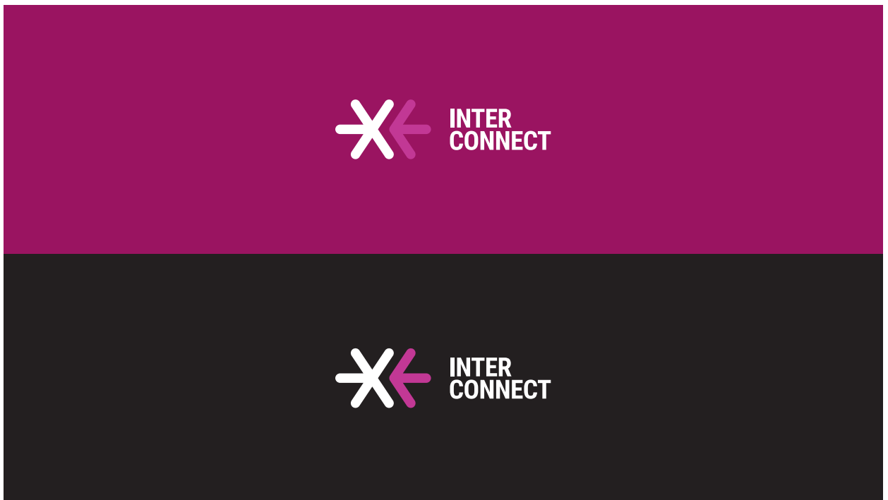
Main logo on dark backgrounds