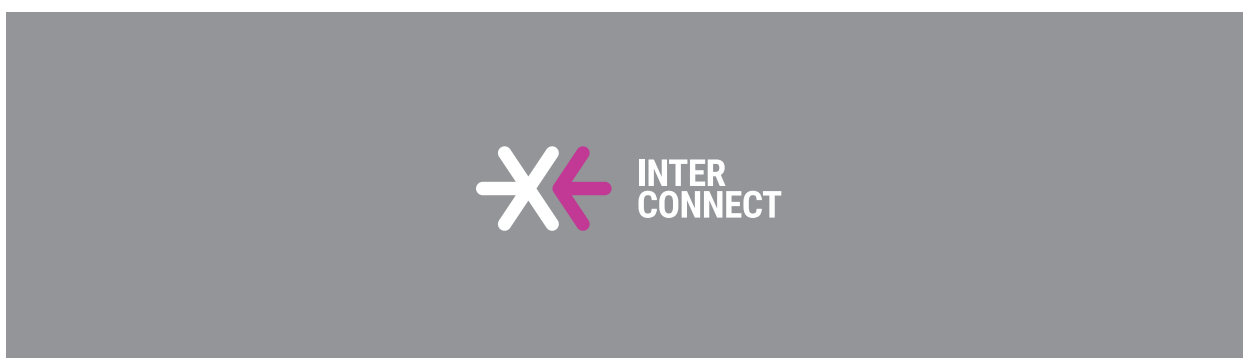
Main logo on 50% black background