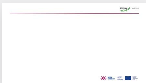
Powerpoint template (provided in a separate file).